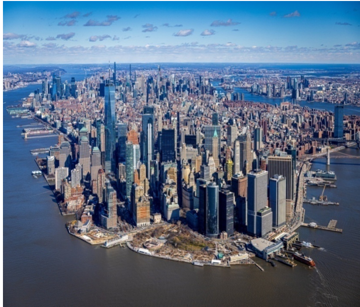
Lower Manhattan, New York City: Babylon the Great?

Certainly, the above descriptions of Babylon could easily fit the U.S. In the history of the world, there is no country with as diverse and multi-national a population as the U.S. In the past, different empires have dominated parts of the world: Asia, Europe, Africa, etc., but there has never been a country with a truly world-wide reach, where people from